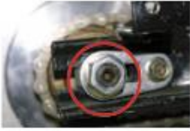
Rear Axle nuts -Check them regularly

Check both axle nuts regularly and especially the rear one. Make sure to tighten the nuts firmly when you change a tube.