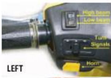
E-SCOOTER XPa and XPc control switches and throttle