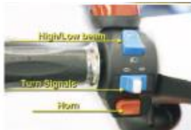
E-SCOOTER XPh control switches and throttle